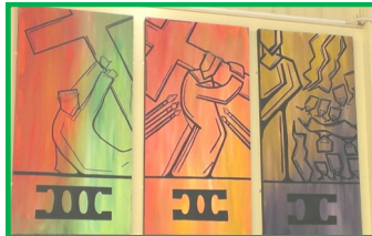
Stations of the Cross created by a St Joseph's pupil

I am currently working with a year 7 form tutor to assist the class in organising and delivering an assembly. It will be based on the Gospel passage of Jesus walking on the water, so the theme for the assembly is one of Trust. One group of pupils has created a drama, another an exercise demonstrating trust whilst a third has written Bidding Prayers. It is great to see these young people's creative power and how they thrive on this kind of achievement.