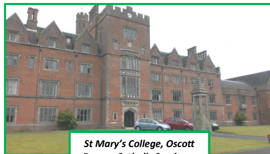
St Mary's College, Oscott Roman Catholic Seminary

In 2010, Pope Benedict XVI visited Oscott College, the first time a Pope has visited a seminary on British soil.